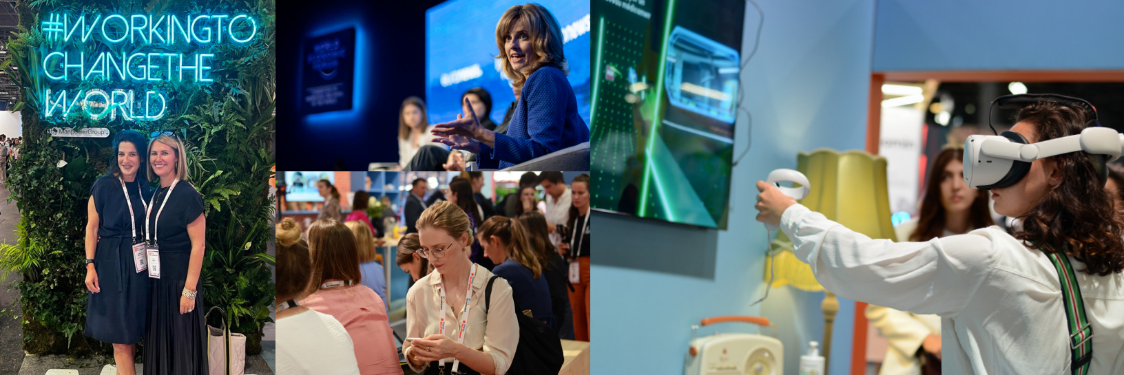
ManpowerGroup's #WorkingToChangeTheWorld lab at Viva Tech, June 2022, Paris