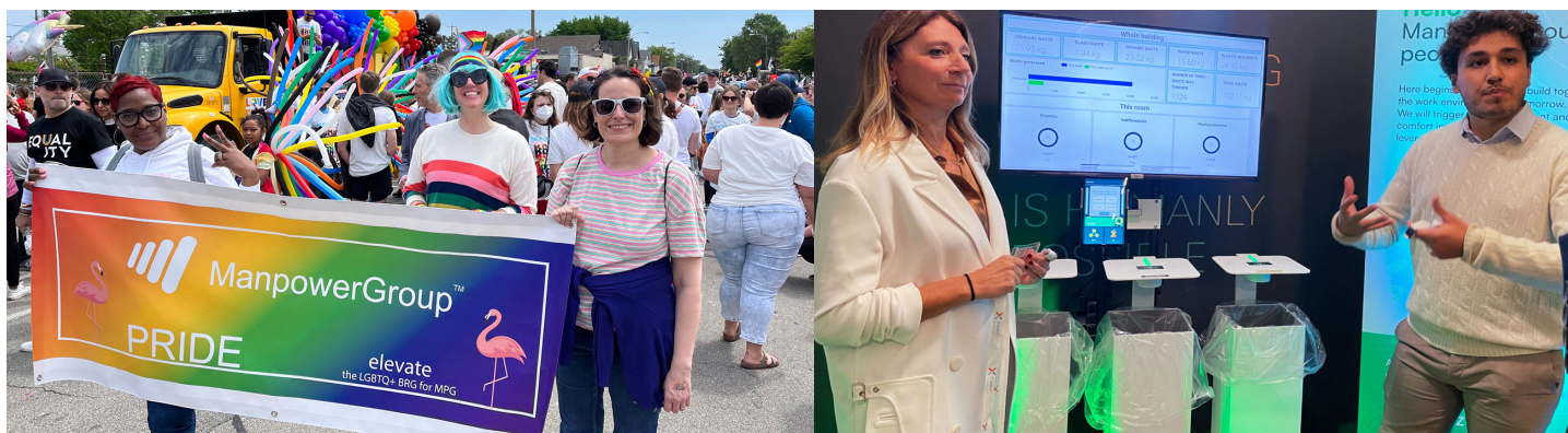
LEFT: Elevate Business Resource Group Pride March, June 2022, Milwaukee | RIGHT: Showcasing AI-Led Innovation at Viva Tech, June 2022, Paris

As we continue to differentiate our higher-value services, we are increasingly focused on innovating to “create talent at scale” by providing advice on career path choices, enhancing skill sets through training and building capabilities from scratch in technology related fields.