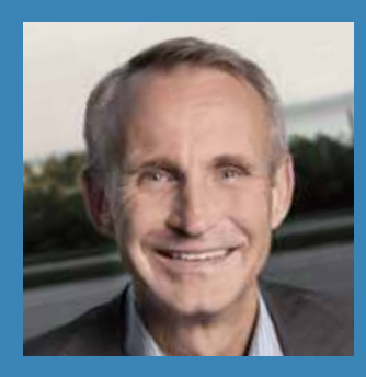
Jonas Prising, Chairman & CEO, ManpowerGroup

Unprecedented times are the new normal. Globally, the labor market is tight. Talent shortages are at record highs, unemployment at multi-decade lows. The voice of the consumer – employee and candidate – is ever stronger and the role of organizations under increasing scrutiny. We need new solutions for the future of work and the future for workers.